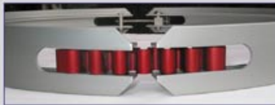
A view of the unique spring clip