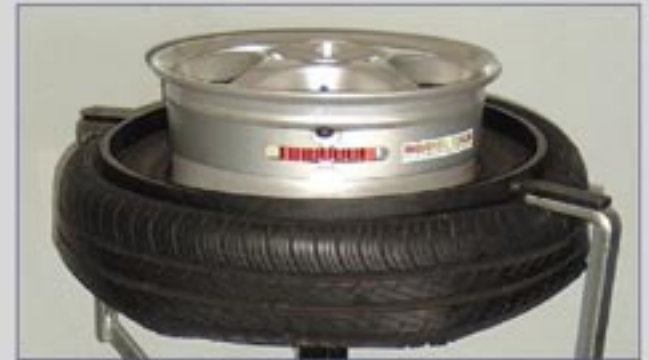
TYRELOK™ in position on the wheel rim

In the event of any form of tyre failure, namathela TYRELOK™ will enable you, the driver, to retain complete control of your vehicle.